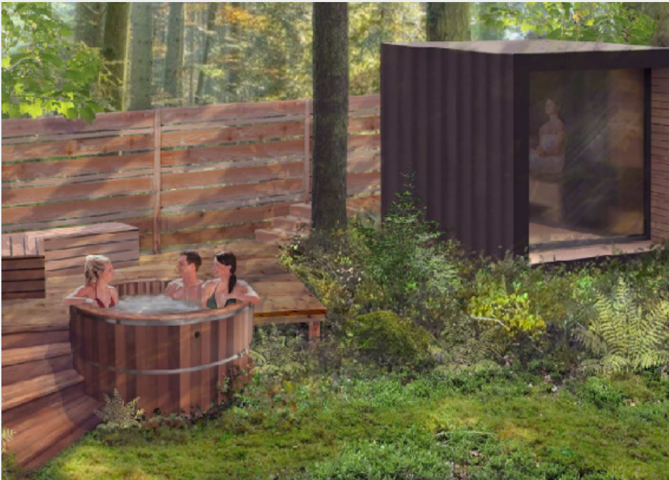
+ OUTDOOR SPA